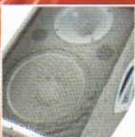
Alto - pg 70