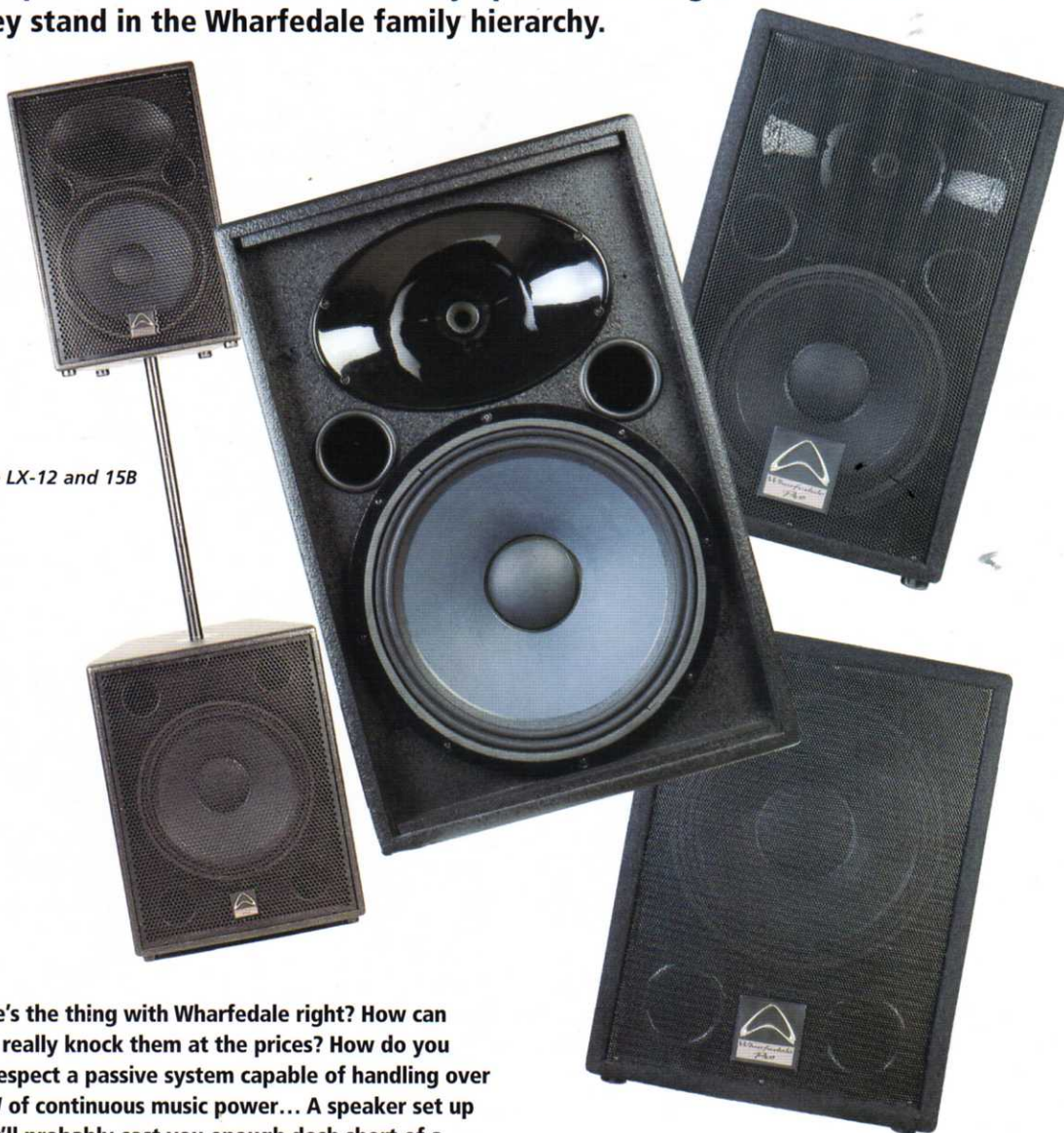
The LX-12 and 15B

Here's the thing with Wharfedale right? How can you really knock them at the prices? How do you disrespect a passive system capable of handling over 2kW of continuous music power... A speaker set up that'll probably cost you enough dosh short of a grand to pay for the petrol to pick them up... From Land's End (or John O'Groats, if you live in Land's End)... And get the burgers in on the way home.