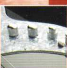
Variax Bass - pg 88