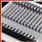
Powerpod K-16 - pg 56