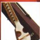
Indian Music - pg 94