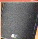
Xperience IV - pg 50